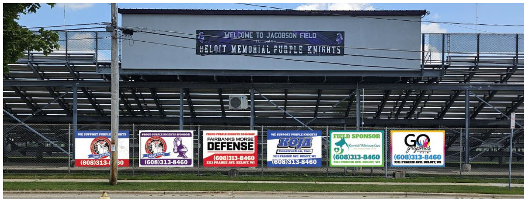
____ Stadium Side Street Fence Sponsor