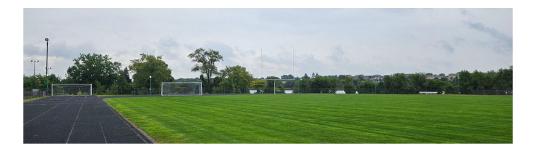
____ Side Line A Frame Sponsor Double Sided