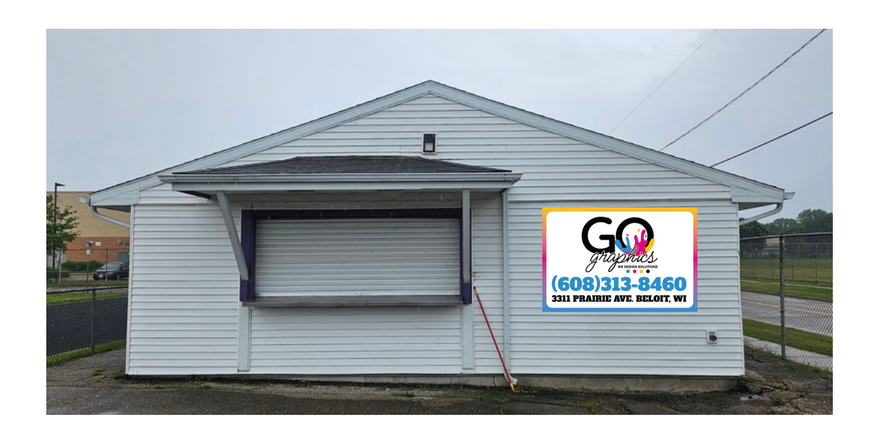
___ Concession Stand Sponsor