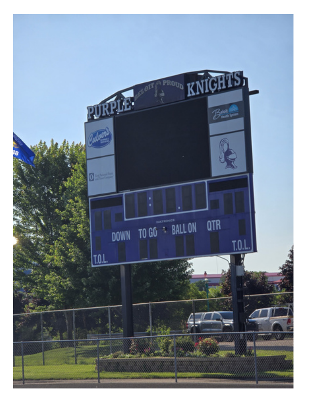
____ Scoreboard Sponsor