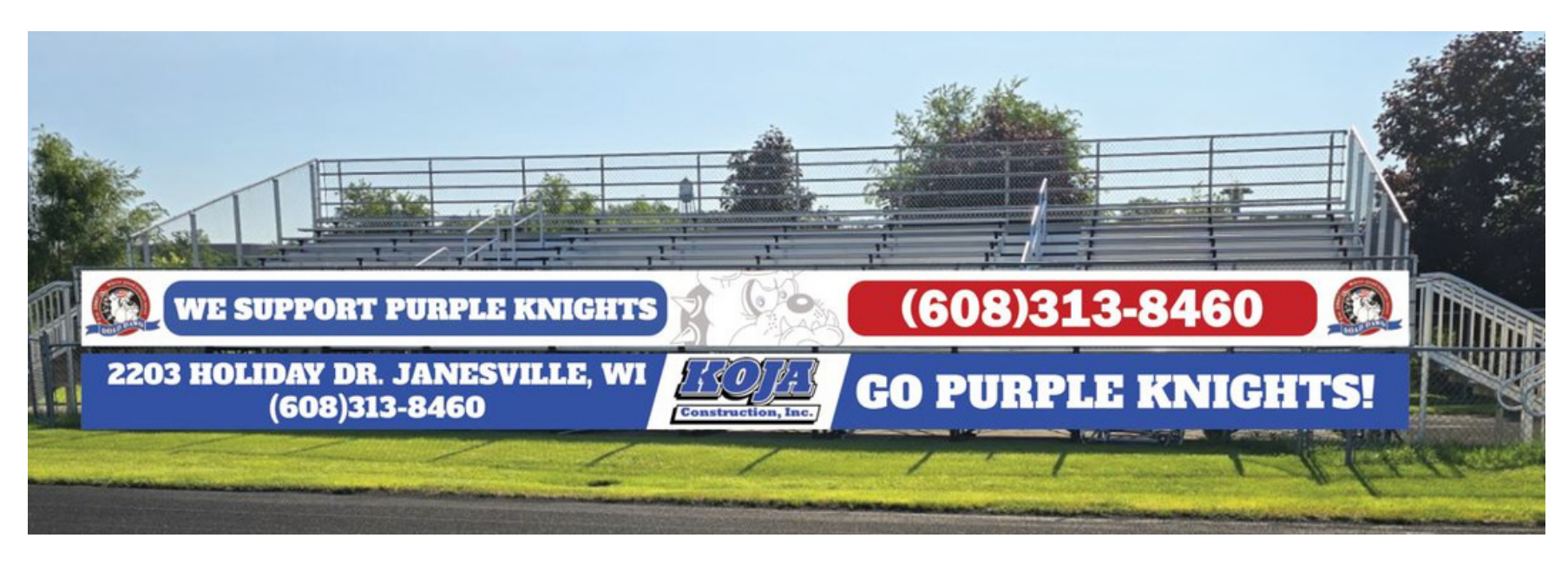
____ Visiting Team Bleacher Sponsor