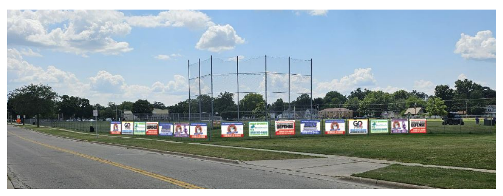
____ Practice Side Street Fence Sponsor