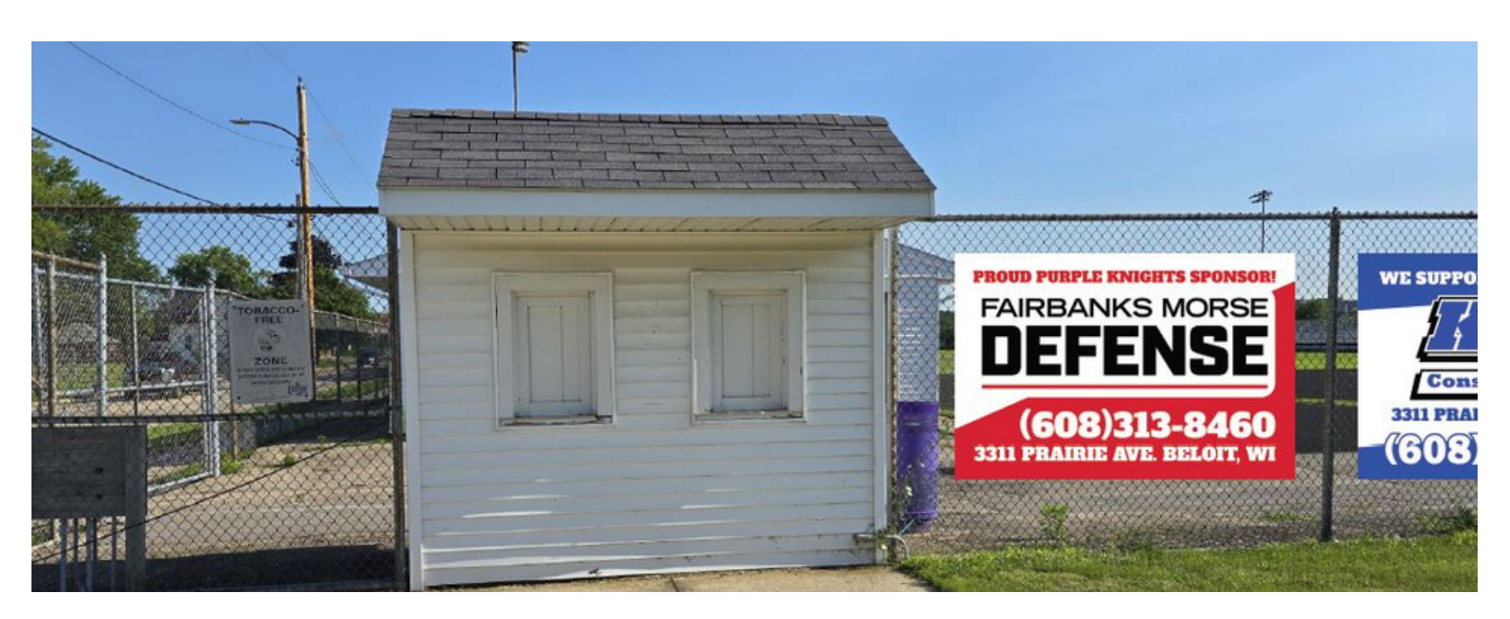
____ Home Team Entry Sponsor