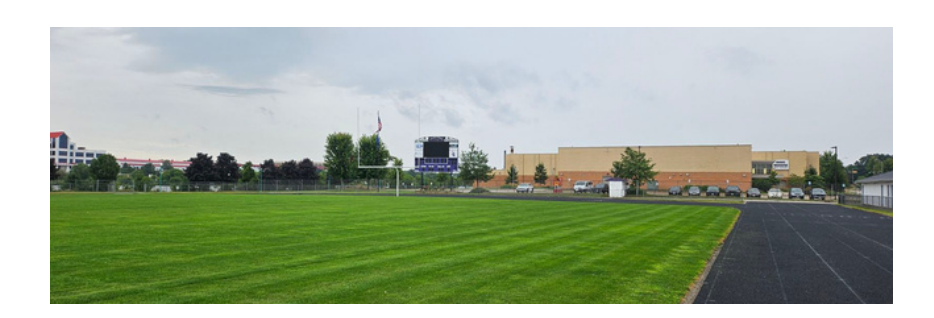
___ End Zone A Frame Sponsor Double Sided